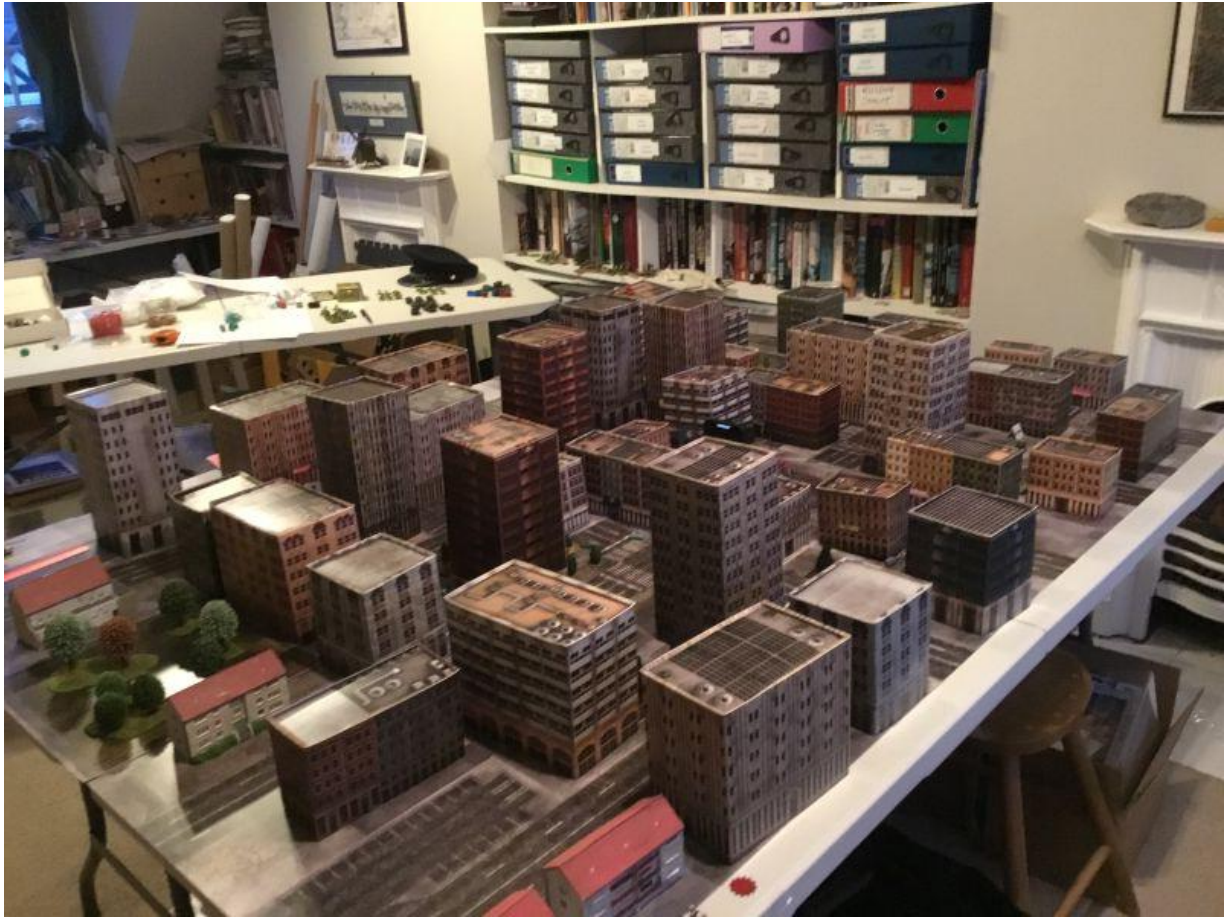
The 10mm table layout. Note the mobile phone just visible just beyond the centre of the table.